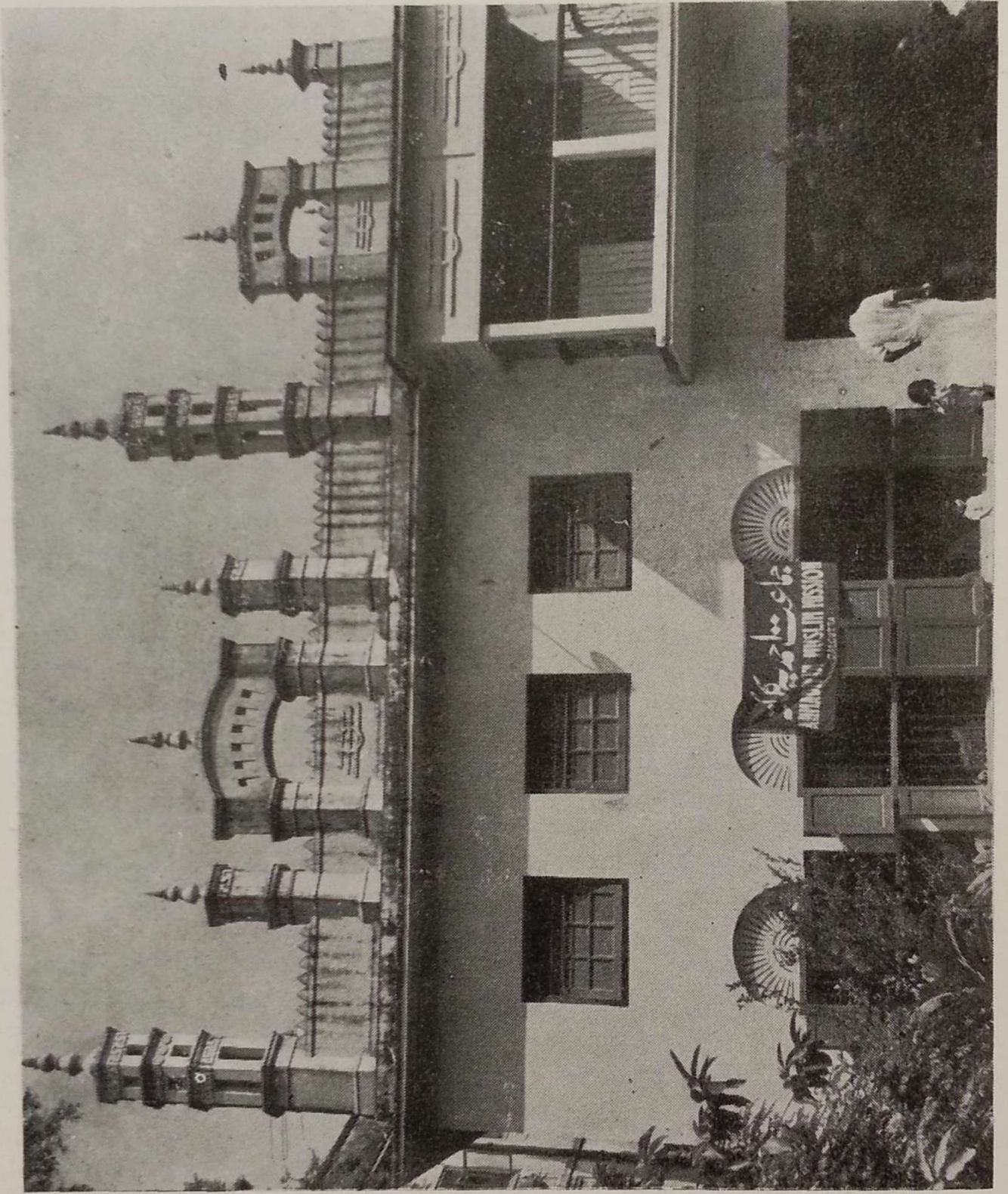
THE AHMADIYA MOSQUE CALCUTTA